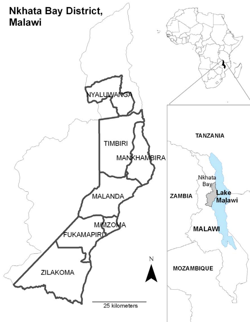
Figure 1. Household interviews were conducted to catalog the consequential lightning strikes in seven Traditional Authorities (TAs) of Nkhata Bay District, fringing the western shore of Lake Malawi. TA boundaries correspond to the period of 2008; Mankhambira TA shown here overlaps the urban TA of Mkumbira (not pictured), which comprises Nkhata Bay Town but was not surveyed. During sampling, Fukamalaza was combined with Malanda TA. doi:10.1371/journal.pone.0029281.g001

on the northwest shore protrudes into the lake and appears prone to disproportionate CLS from storms over the lake.