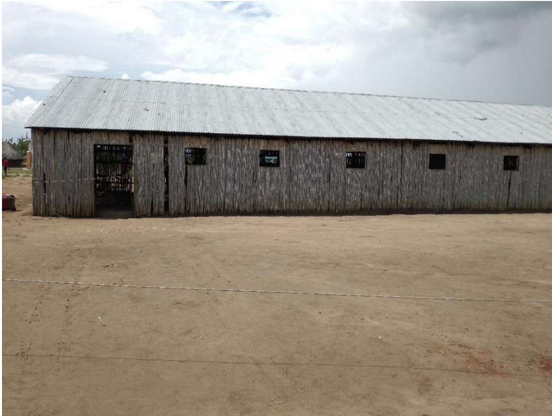
Depicts the area hit by lightning.