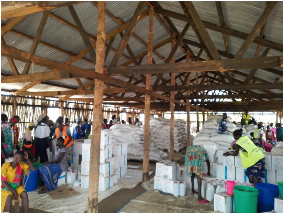
Damage to the wooden poles and other areas inside the structure.