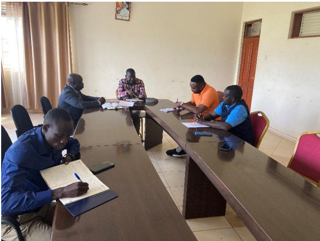
DRDC briefing the entire team from ACLENet and OPM representative.