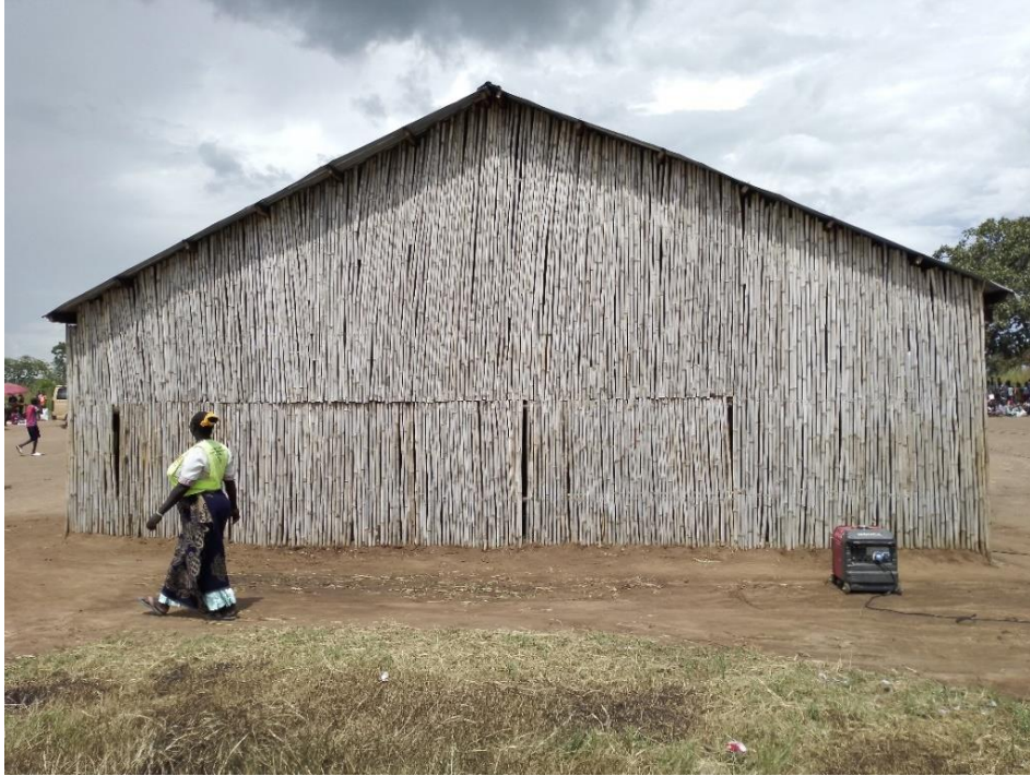
No significant damage.