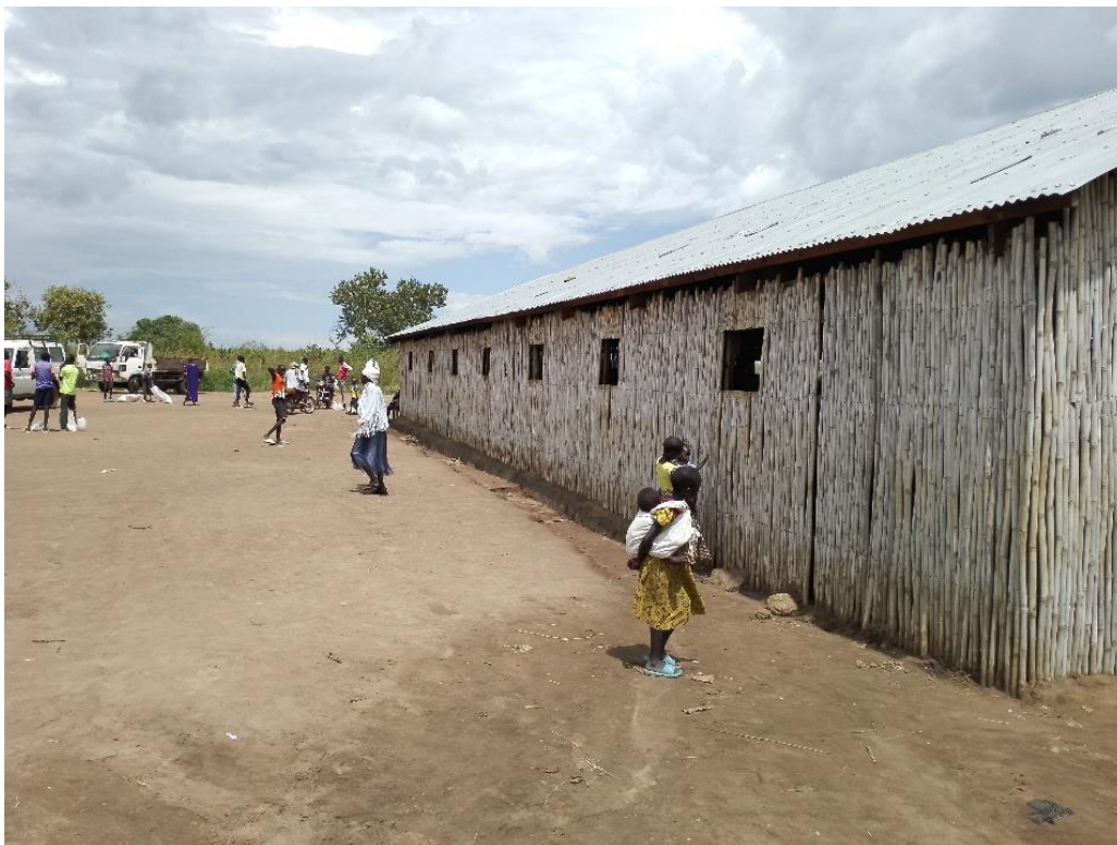
Shows new minor breakages in the bamboo to the right side of the rightmost window..