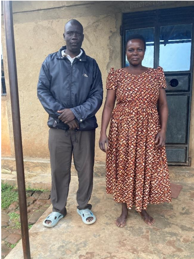
A teacher who was affected by lightning and is facing the challenge of memory loss standing together with her husband at their home when ACLENet team had visited them.