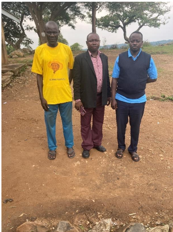
Chairperson Local council Omoyo subcounty who works as parents teacher association chair person with the headteacher of Omoyo primary School together with the country coordinator ACLENet after counselling the learners of Omoyo primary school.