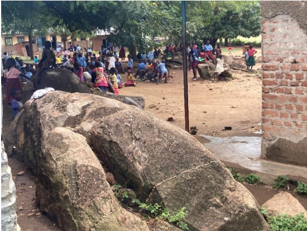
Rocks around the school, most of the area is covered with these rocks.