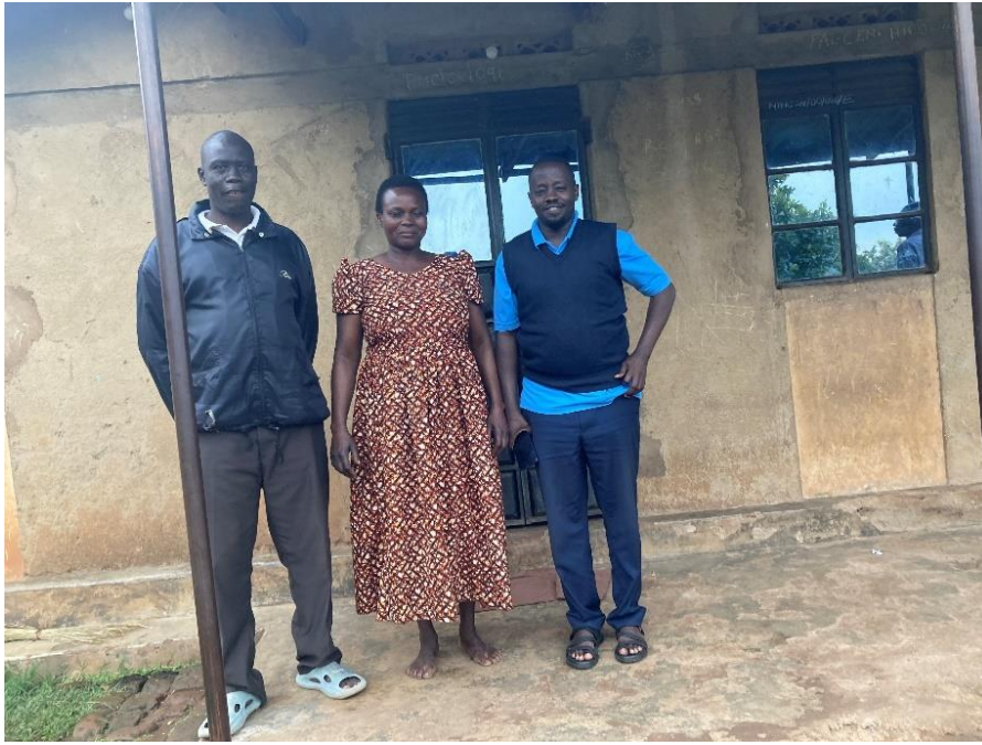
Barnabas (ACLENet) team with the family of the affected teacher.