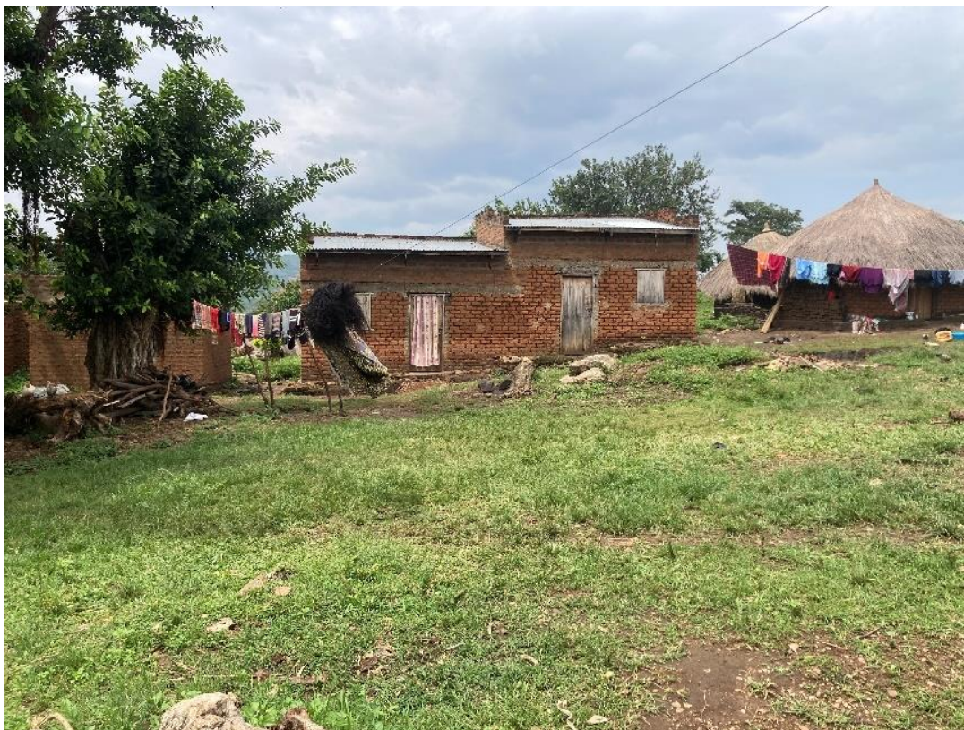
View of the staff houses at Oweko primary School.