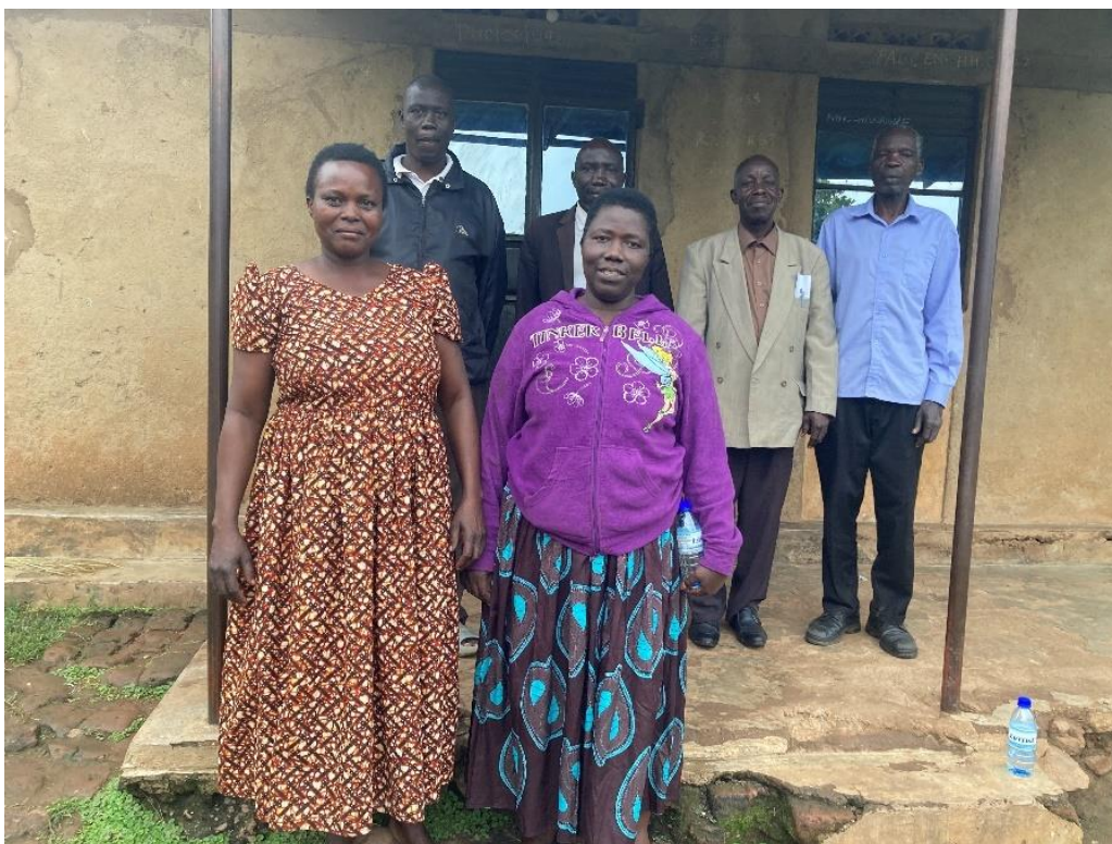
A team of leaders posing for a photo with a teacher who suffered the lightning strike.