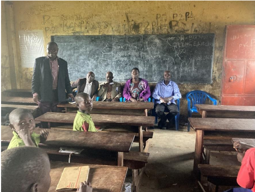
The headteacher of Omoyo primary School addressing the survivors with other political officials watching.